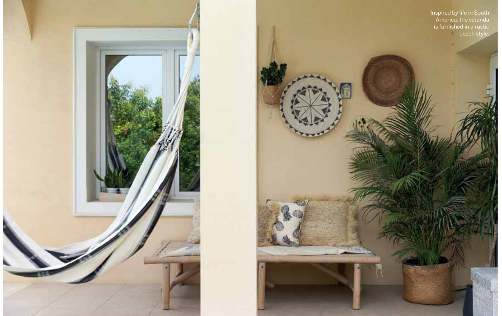
Inspired by life in South America, the veranda is furnished in a rustic beach style.