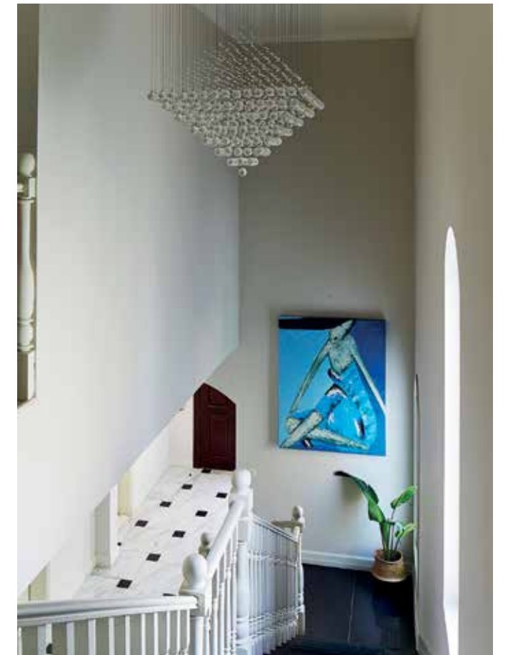
Clockwise from top Yorkshire terrier Theo is at home in the kitchen. The vaulted staircase features a stunning crystal pendant light and artwork gifted from friends. An amusing painting by Chilean artist Renate hangs above a console table from Crate and Barrel, which complements the black Kartell dining chairs and oak table.