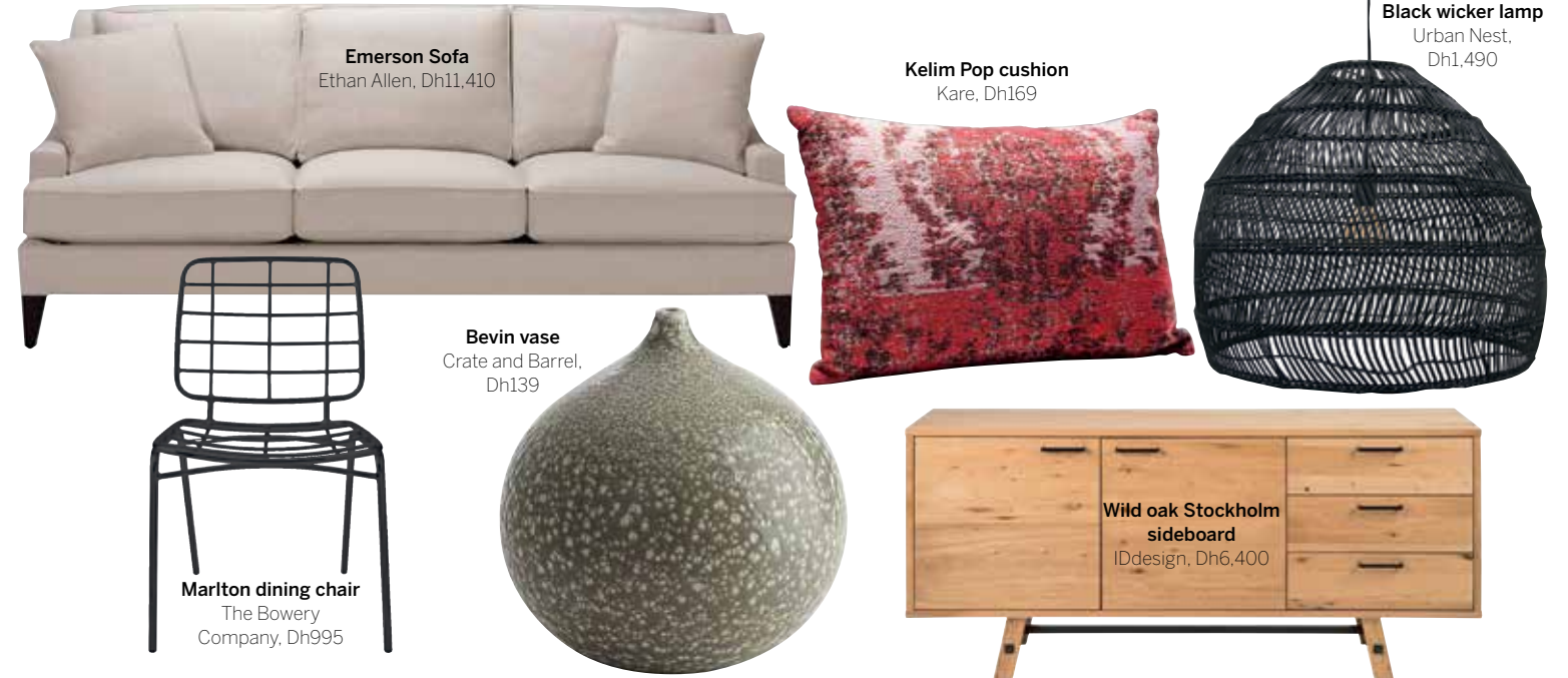
Emerson Sofa Ethan Allen, Dh11,410