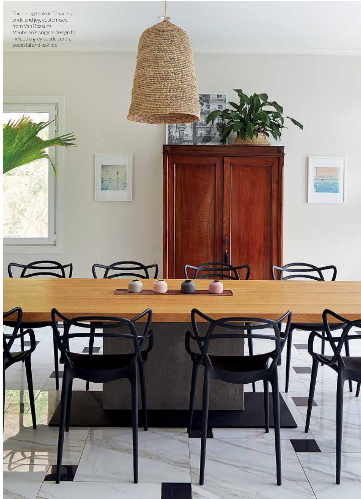
The dining table is Tatiana's pride and joy, customised from Van Rossum Meubelen's original design to include a grey suede central pedestal and oak top.